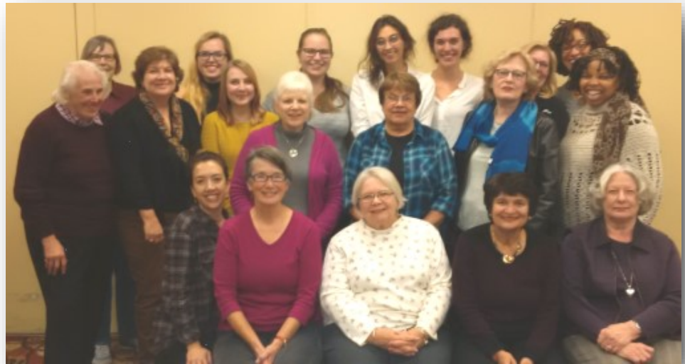
Members of GWIS with AAUW NYS Board members at the Fall Board Meeting held in Albany in November.

AAUW is committed to achieving gender equity. The programs and projects that are funded by your generous donations to the AAUW Fund are moving us closer to that goal. Your contributions to the Eleanor Roosevelt Fund have made possible ground-breaking research on issues related to gender equity in education and the workplace. Several recent reports involved STEM (Science, Technology, Engineering and Math). Why so Few? Women in Science, Technology, Engineering and Mathematics presented research findings that pointed to stereotypes, gender bias, and the climate of science and engineering departments in colleges and universities to blocking women's progress in STEM. The report Solving the Equation: The Variables for Women's Success in Engineering and Computing took a closer look at the two STEM fields where the jobs are but women aren't, and what we can do to add women. The latest research, Barriers and Bias: The Status of Women in Leadership , examines the causes of women's