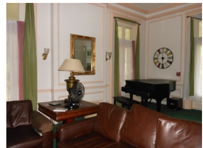
Home of Elizabeth Cady Stanton's Cousin

From old letters discovered in my attic, I found that my grandmother had stayed with Elizabeth Cady Stanton's cousin in Geneva, NY, several times, once for a month planning strategy and a major fundraiser. Walking on that lawn where it was held and where my grandfather received a life membership in the NYS Women's Suffrage Association was a mind-blowing experience!